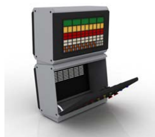
Dual tier with optional front panel access