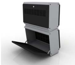
Dual tier with rear panel access